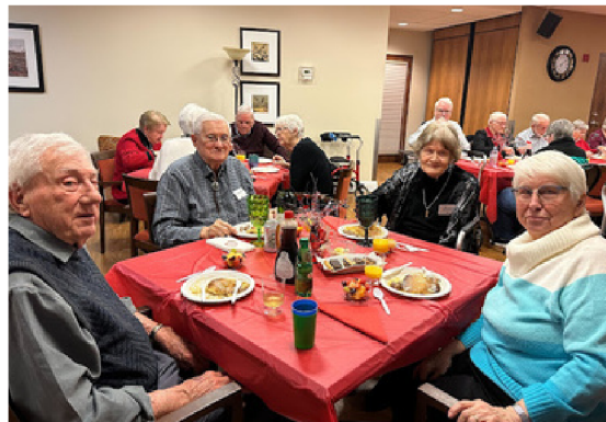
Bennett Staff and Gallery residents on Valentine's Day