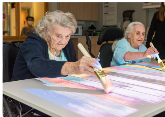
Residents trying out the new interactive Mobii projector