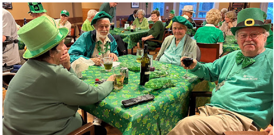
The Gallery Active Living